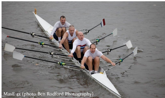
MasE 4x