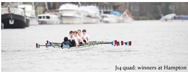
J14 quad: winners at Hampton

Walton Small Boats Head took place on 12th December and had 660 entries. Sadly, after two divisions had taken place, and most of the crews were already on the water for Division 3, the umpiring team made the decision to suspend all further racing because of the strong winds — a big disappointment for the crews as well as the organising committee. Medals were awarded on the basis of the two divisions that had completed, and crews in divisions 3 and 4 received a full refund. The Club's eight winners included J14, J15, J16, J17 and MasC crews; we also had two Walton-grown winners racing for Pangbourne Col-