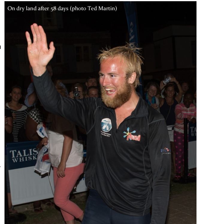
On dry land after 58 days