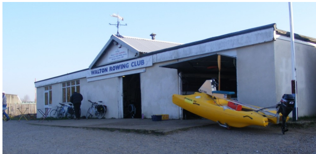
The boathouse today

Almost half the Club's boats are now stored outside, where they are subject to weather damage and vandalism. We have very limited facilities for disabled access (although we have several adaptive athletes using the Club) and the women's changing room is hopelessly small.